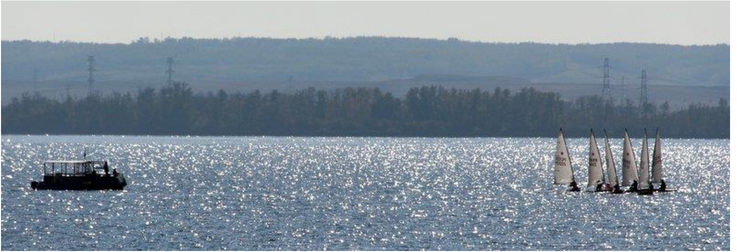
A tight rounding at the leeward mark